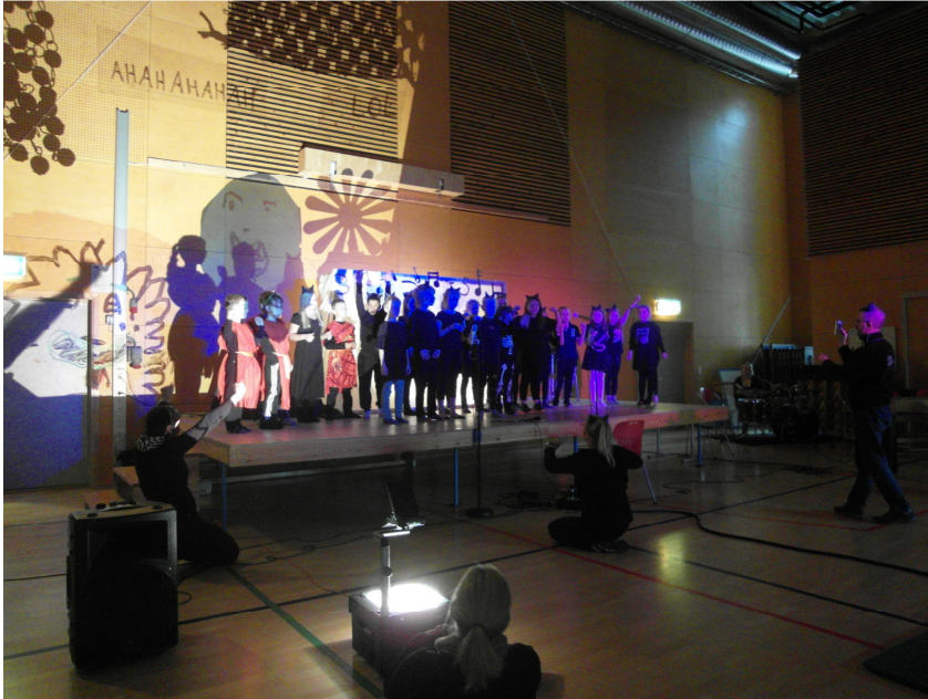
Image 3: 3rd grade pupils during "The Math Cat" opera at Sagvåg School, Norway

Students perform mathematical prediction and realize a creative, arts-infused case study scenario: Recording observations; Performing predictions compared to results; Developing experimental models; Participating in creative case study scenario (WASO).