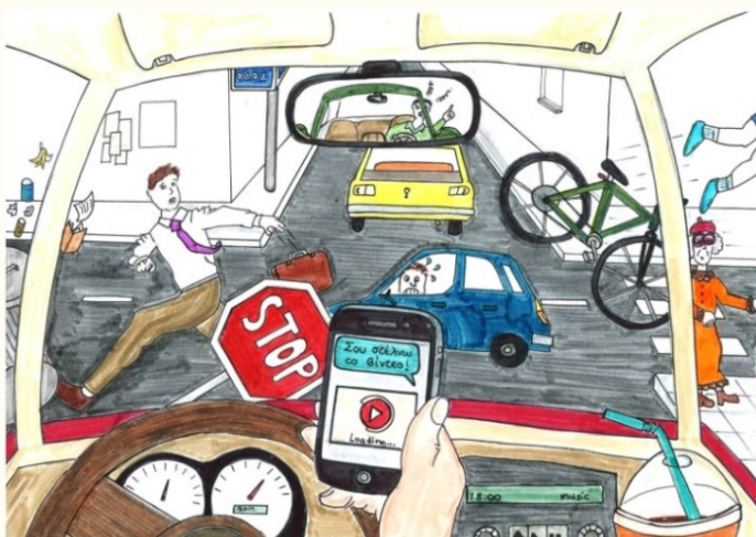
Figure 1. Road Safety campaign on distraction and vulnerable road users. 5th Gymnasium of Alimos, Greece (RSI "Panos Mylonas" nationwide school contest 2016).

Make sure all students understand the concept of vulnerable road users. You may want to discuss examples before start working on your campaign