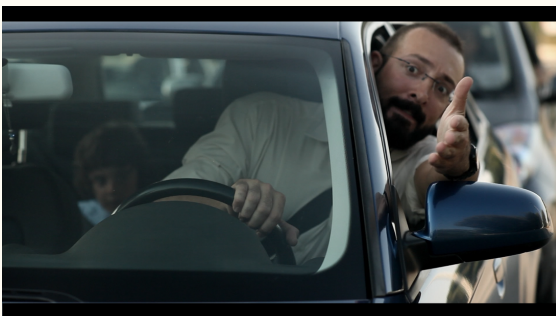
"RSI "Panos Mylonas" Aggressive drivers TV Spot"

Anger proves to be related to aggression and risky driving behaviour: drivers who get angry often drive more aggressively and seem to be involved in accidents more frequently (SWOV, 2012).