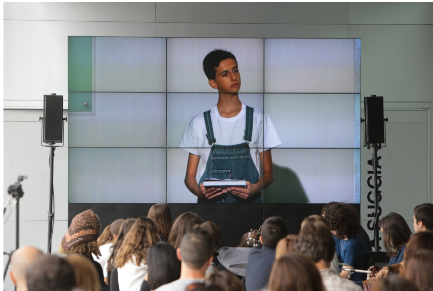
1 In the Global Science Opera, the various opera scenes take place around the globe in real time

Over the complete production, the complete GSO network simulates an “opera company” in which performers, composers, designers, scenographers, science educators, etc., collaborate to create an opera. There is therefore no “one size fits all” approach to the activity. Typically, though, a school will receive a scene in the opera, which they will write the libretto for following their exploration of the scientific theme at hand, and thereafter compose music for it, and perform that scene by video or online, as part of a global community.