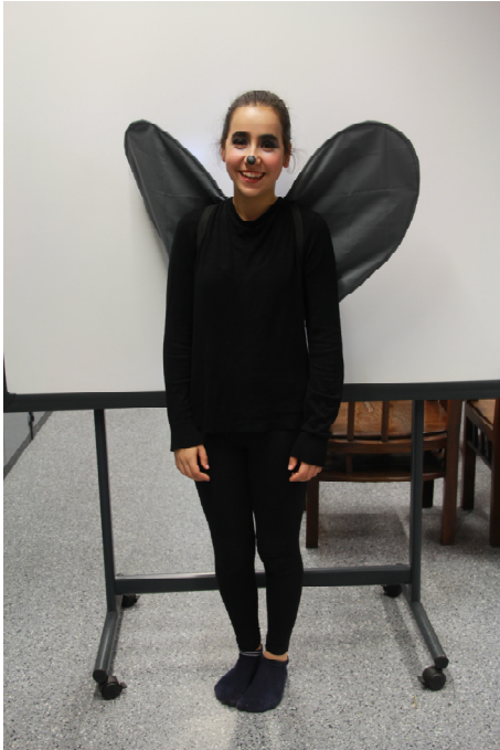
"Firefly" is one of the main characters in the "Ghost Particles" opera

In arts education, the objectives are to learn school opera as a methodology, including specific skills and inquiry with the various included arts education domains (music, drama, scenography, light design, etc.).