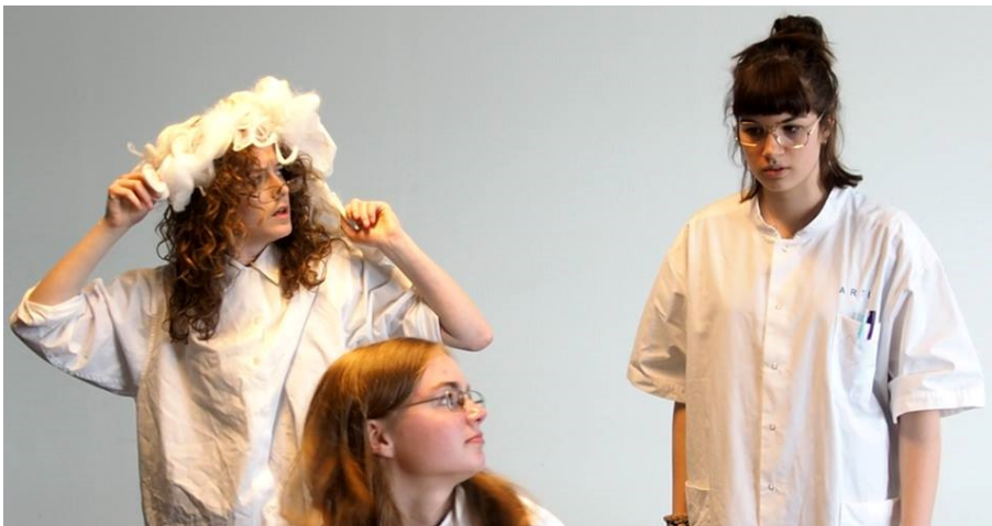
Ghost Particles rehearsal for European Opera Days (EOD), Holland (May, 2016)

The Global Science Opera (GSO) annual production in 2016 (“Ghost Particles”) focuses on particle physics, and specifically the particles photon, neutrino and Higgs boson. The opera communicates scientific knowledge about these particles as well as some of the creative processes that led up to our understanding of them (e.g. Wolfgang Pauli’s postulation of the Neutrino particle in 1930 and the process that ensued). Through both science and arts education activities and a virtual visit to CERN, pupils engage with inquiry-based activities.